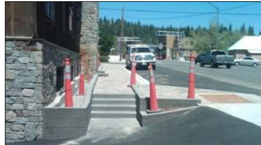
Bridge Street / West River Street pedestrian streetscape improvement project

Bridge Street/West River Streetscape Improvement Project – Improvements will enhance the pedestrian corridor in the vicinity of the Bridge Street/West River Street intersection. Work has begun on this project to construct a sidewalk and new parking along Bridge Street south of West River Street. The work should be completed by the end of June.