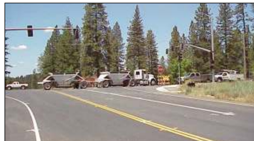
Traffic signals on SR 49 and La Barr Meadows Road to be activated later this year

Safety concerns and accident statistics in the La Barr Meadows Road area initiated discussion at the August 2003 Nevada County Transportation Commission (NCTC) meeting on the need for highway design modifications at this location. Funds were identified to begin design work and Caltrans conducted workshops to get public input and consensus on proposed improvements. Flashing hazard signage was installed to warn travelers to slow down in this area to allow for vehicles accessing and exiting the highway. The California Highway Patrol also focused on speeders along the SR 49 corridor. All of these efforts decreased the number of accidents and fatalities in the area.