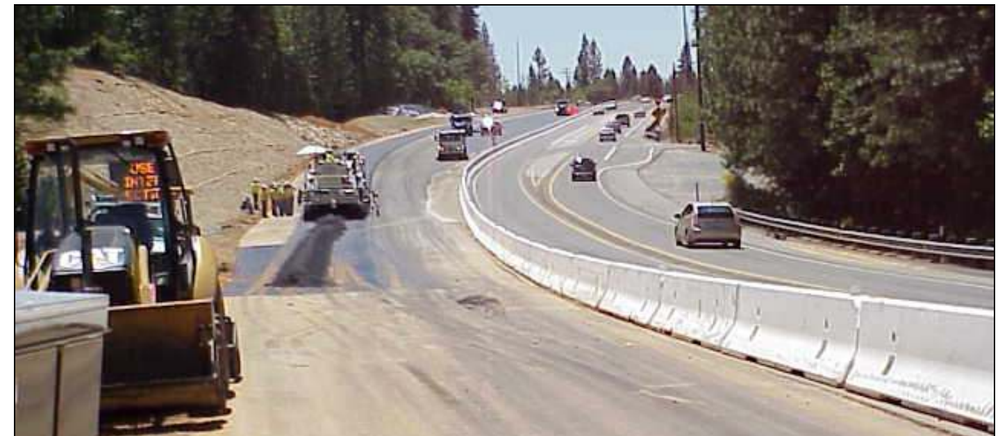
The SR 49/La Barr Meadows Road widening project will provide four lanes of traffic, turning lanes, wider shoulders and frontage roads

Work is underway in the second season of construction for the SR 49 widening project near La Barr Meadows Road south of Grass Valley. DeSilva Gates Construction is gearing up to transfer traffic from the existing highway to the new pavement on the east side of SR 49 during the first part of July. With traffic moved to the east side, they will work to complete the frontage road connections from Tall Pines Mobile Home Park to Ponderosa Pines Mobile Home Park on the west side of the highway. Sound walls will be constructed on the west side at Mountain Air Mobile Home Park and near Kenwood Drive. Once the frontage road and sound walls are completed, the new traffic signal at the fire station will be activated during the final stages of the project.