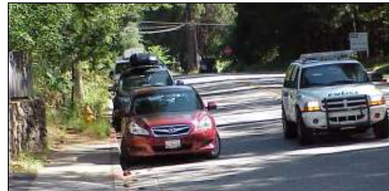
Zion Street sidewalk heading toward Ridge Road will extend around the block

Zion Street / Ridge Road Improvement Project – This sidewalk project begins near Fuden Juice on Zion Street and extends around the corner onto Ridge Road and connects with the sidewalk on Searls Street with crosswalks, a retaining wall, and curb ramps. The bid opening is June 28, 2012 and the project is estimated at $325,000. Work is scheduled from July through September 2012.