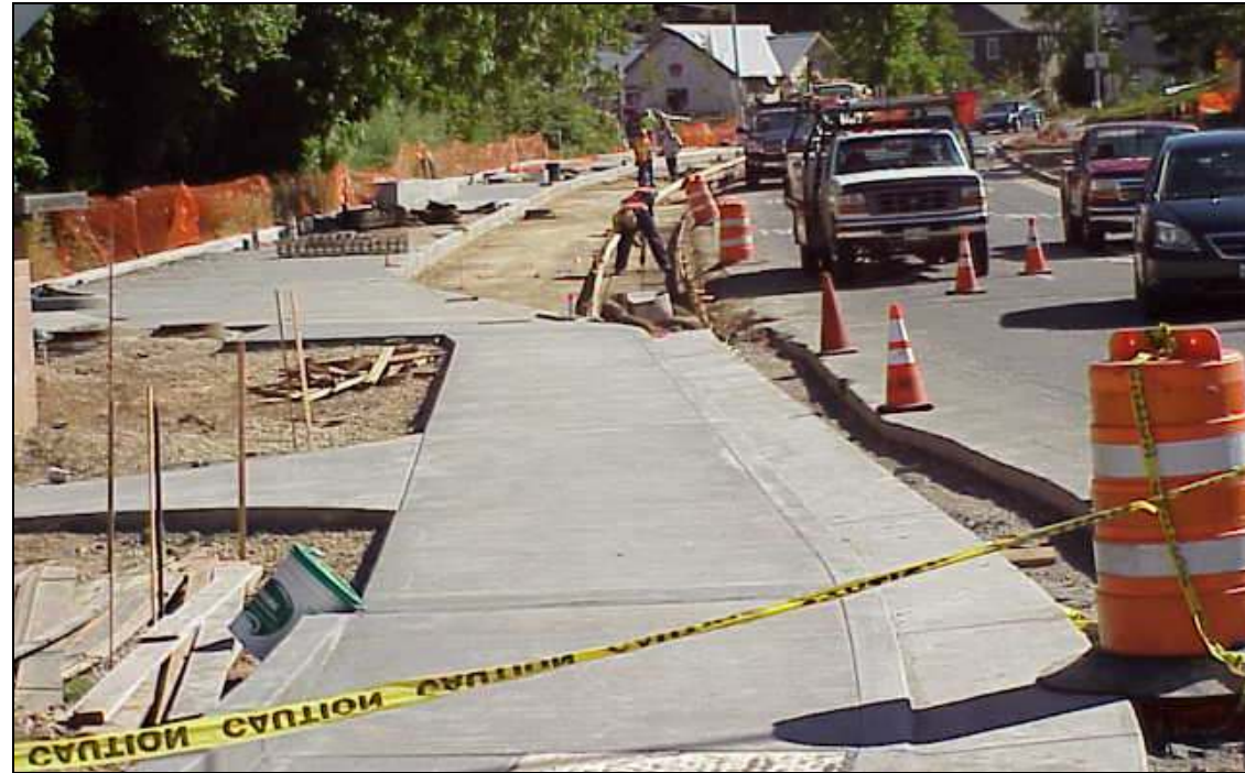
Buses will be able to pull into this transfer center to pick up and let off passengers without obstructing traffic

Tinloy Street Transit Transfer Center – Nevada County Department of Public Works is managing construction of the project on Tinloy Street in the City of Grass Valley (adjacent to SR 20/49). The transfer center will be used by Gold Country Stage buses to provide riders a location to access downtown Grass Valley or transfer from one bus route to another. Currently the transfer location is at the corner of Church and Neal Streets and buses jam into a small section of a busy downtown street to provide this service. The construction schedule is to have the transfer center complete and functioning by fall.