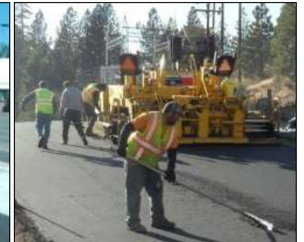
Paving and drainage projects planned this summer

2012 Paving and Drainage Project – The Town plans to pave various roads and improve roadside stormwater drainage facilities, such as ditches and curb and gutter in select locations. Roads that will potentially be paved include Donner Pass Road by Donner Lake, a short section of Deerfield Drive, a short section of Pioneer Trail, Palisades Drive, Ponderosa Drive, Martis Valley Road, Alder Drive by the middle school, River Park Place, and a short section of Schussing Way immediately south of Alder Creek Road. The Town will likely award a construction contract in August. One-way traffic control will be required during some phases of construction.