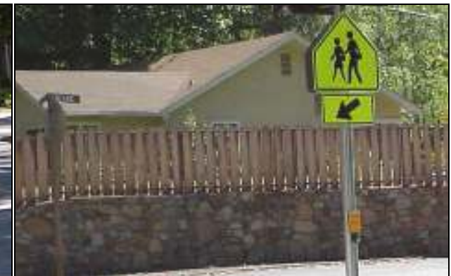
Natural stone retaining wall will be built where needed

East Broad Street Pedestrian Sidewalk on the West Side from Main Street to SR 49 – Design is 80% complete and the project is estimated to cost $150,000 to build. Plans are to have a “safe routes to school” crossing at Main Street for the two schools operating down the street. The sidewalk will connect to the county trail that starts at the SR 49/East Broad Street intersection and proceeds to the Nevada County Rood Administration Building and the Library. Congestion Mitigation and Air Quality (CMAQ) funds will be used to build the project.